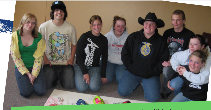
Teens Campin' Out at the HopeWest Kids Teen Retreat in Mesa, CO. Camp is a good way to build relationships through common bonds.

Carefully constructed group sessions and a memorial service are intermingled with activities such as writing, artwork, crafts and games. Camp includes outdoor activities such as hiking, water games or swimming, and campfires that allow