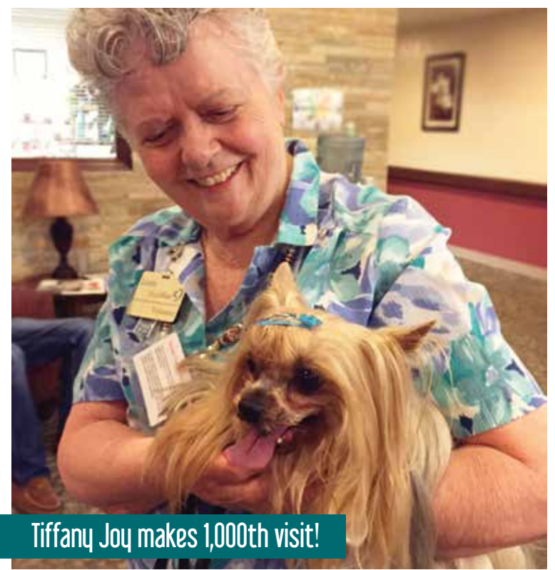
You too can become a volunteer at HopeWest. Learn more about our many volunteer oppotunities by visiting HopeWestCO.org.