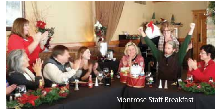
Montrose Staff Breakfast

We had a wonderful time getting our employees together to celebrate the holidays at our annual staff breakfasts! This year's theme was The Nutcracker. Employees were recognized with the Heart of Hope Award for living out the HopeWest values and others were recognized for years of service at HopeWest. Thank you to all of our dedicated employees who exemplify our values, empower our vision and carry out our mission of helping others every day.