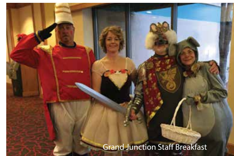
Grand Junction Staff Breakfast