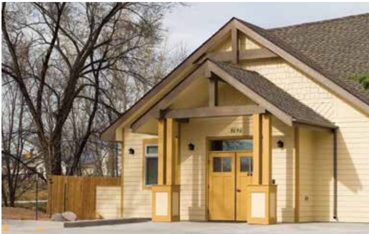
New office/receiving/storage building

We received the official certificate of occupancy for our new office/receiving/storage building located at 3050 North 13th Street (right behind the Care Center in Grand Junction). Our facilities team is housed there as well as much needed storage.